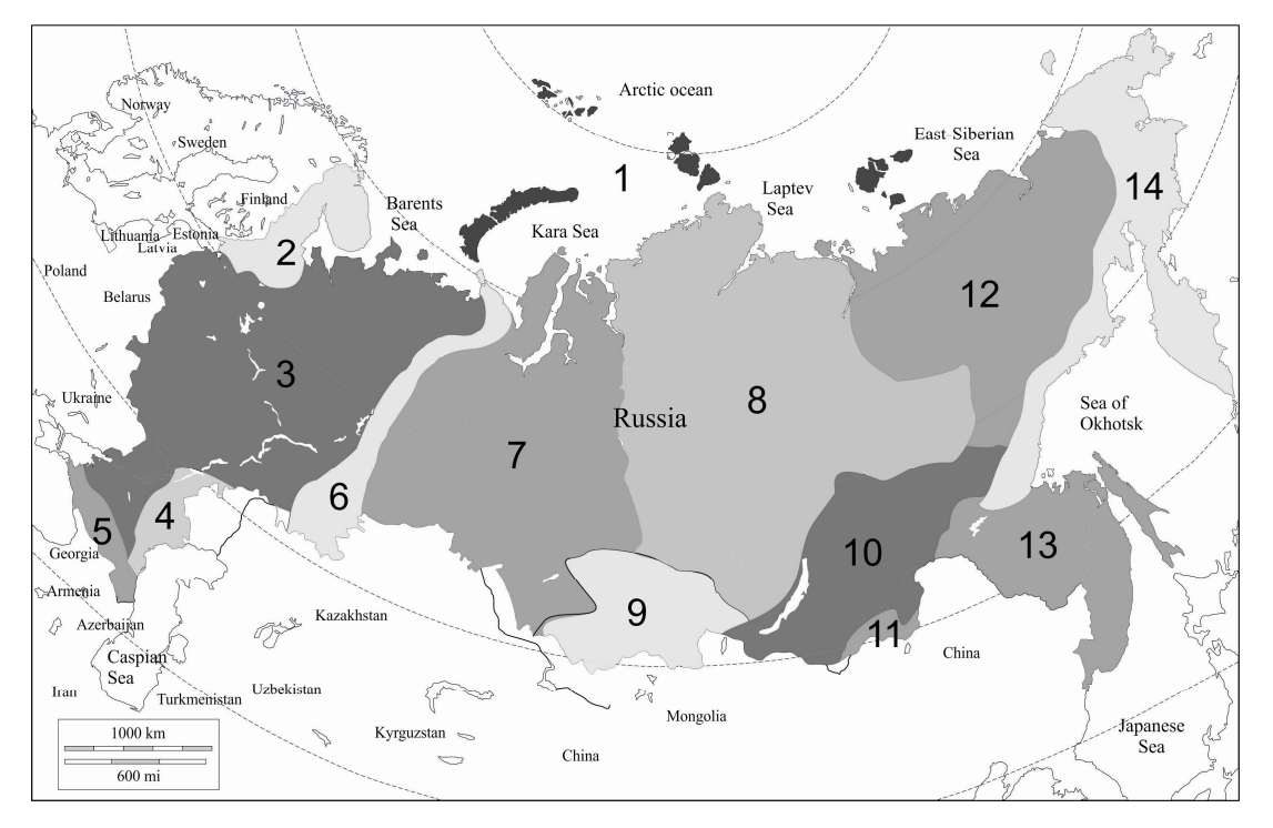
Figure 1. The physico-geographical countries of the Russian Federation: 1 – Arctic Islands, 2 – Kola-Karelian (Fennoscandia), 3 – East European (Russian Plain), 4 – Caspian, 5 – Caucasian Mountainous, 6 – Ural Mountainous, 7 – Western Siberia, 8 – Central Siberia, 9 – Altai-Sayan Mountainous, 10 – Baikal area and Transbaikalia Mountainous, 11 – Daurian, 12 – North-East Siberia, 13 – Amur-Sakhalin, and 14 – North Pacific Ocean.

published through the Global Biodiversity Information Facility (GBIF) to provide open access to data (Mukhin and Vladykina 2020).