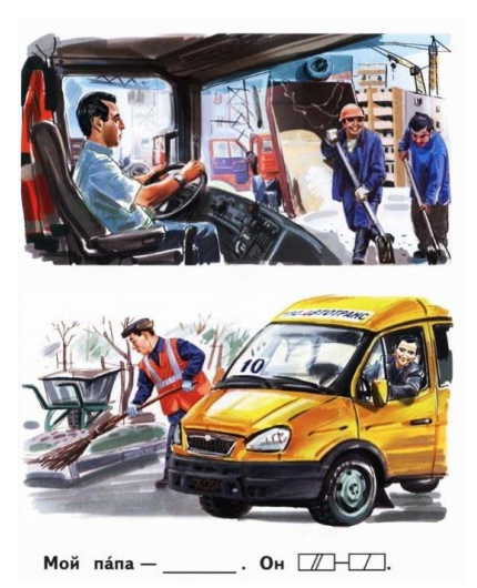
Figure 2. Culture-related content with tag Another culture in textbook for migrant children (ed. Aznabaeva, ABC-book, p.11).

In addition, the pragmatic component in the Russian language textbooks was separately analyzed. Most often, pragmatic information (how to name person, meet, say goodbye, ask for forgiveness, and etc.) is included in textbooks content implicitly, and there are no special notes containing pragmatics. Making this content accessible to students is an additional burden for teachers. For example, for some YLL it is hard to distinguish usage of pronoun you ("ты" for informal situations and "вы" for formal context).