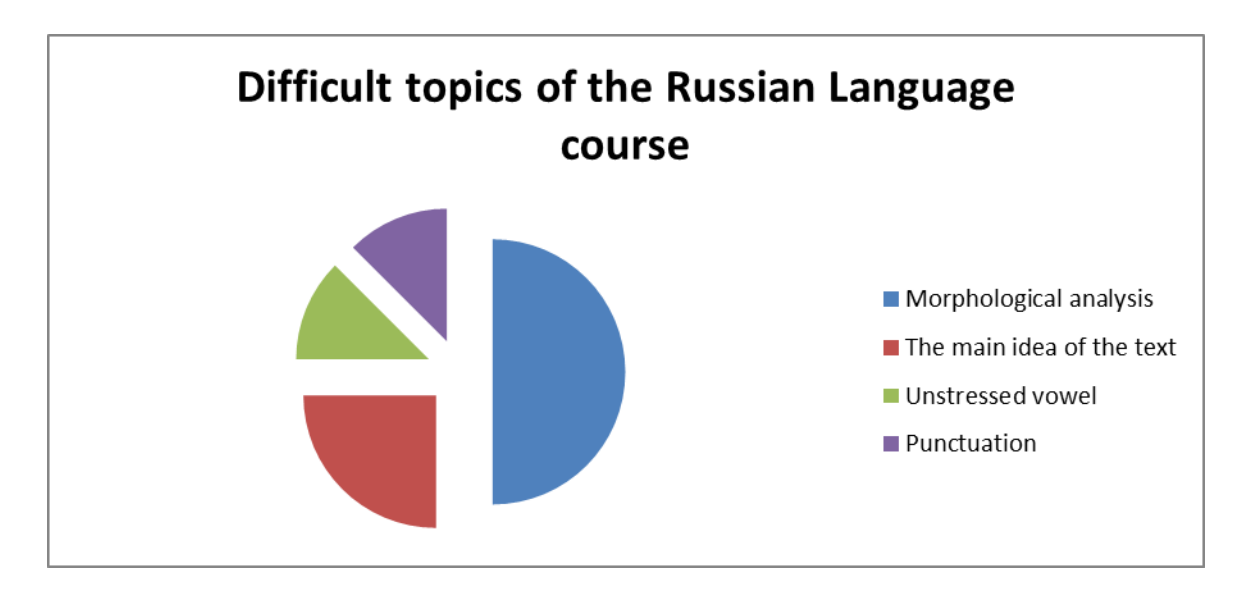
Figure 2. Results of primary school students' survey

Figure 2 shows the most poorly mastered topics of the course "Russian language", identified by the students themselves during the survey.